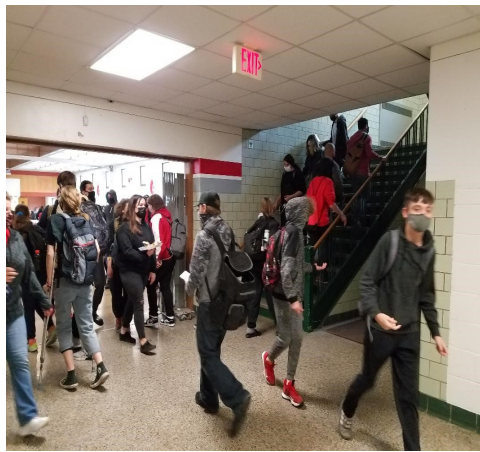
CAFETERIA AT CHANGE 2ND HALF