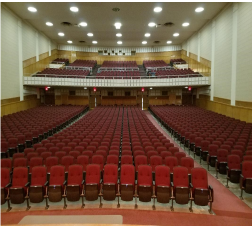
AUDITORIUM 1000 SEATING

The PSHAA will continue its' practice of supporting post high school education opportunities by funding 11 scholarships through the annual Parma Council of PTA's scholarship program. Seven of the scholarships are funded via PSH Alumni Association's fund raising efforts and 4 more are funded through the generosity of individual sponsors. Graduating senior from Normandy and Valley Forge High Schools are eligible to apply for any or all of these scholarships if at least one parent or grandparent attended Parma High School. The scholarships are applicable to college, junior college, or post secondary technical education programs.