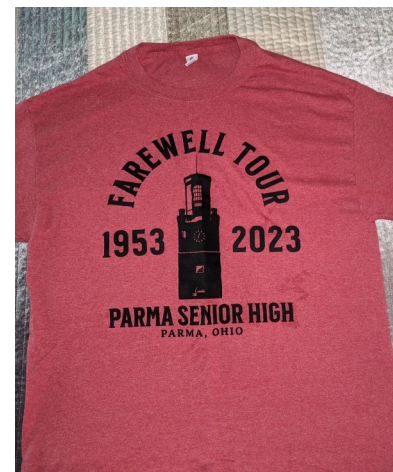
Spring into to Spring with A TEE

Thank you for your patience and co-operation