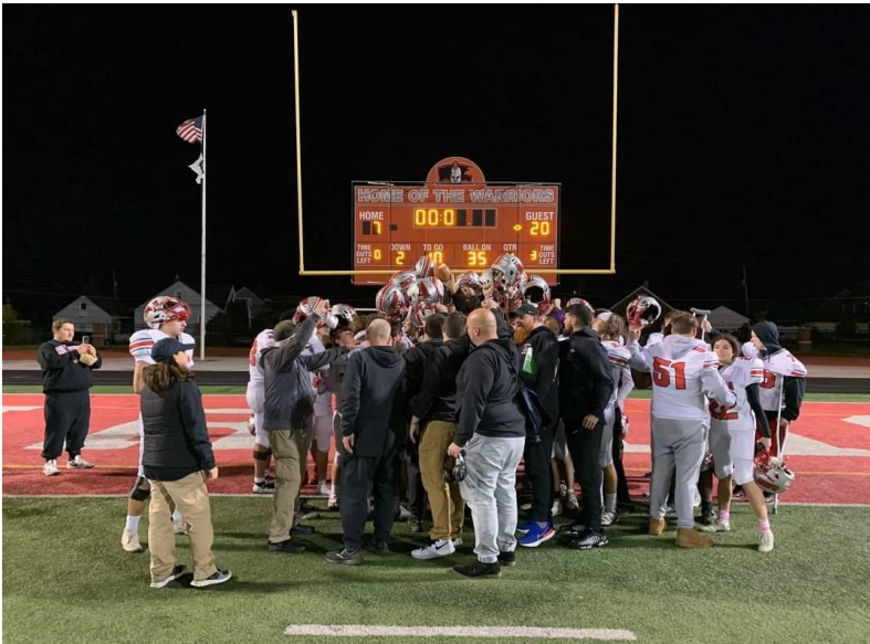
Final Score of PSHS last game Parma 20 Fairview 7