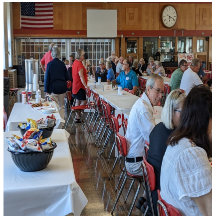
Photos from this years Golden Reunion. About 150 attended the Saturday August 27th affair A tour of about 35 Alumni took a last look of PSHS

You are quite welcome We look forward to hearing about your progress toward your goal as a Marine Biologist,