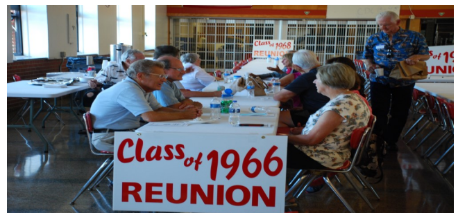
Some of the 165 attendees celebrating in PSH Cafeteria at the 9th Golden Reunion on Saturday, August 25, 2021. Join us in 2022!