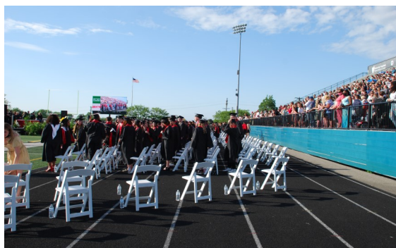
The 2021 PSH Graduation took place at Byers Field on a early Saturday evening in June