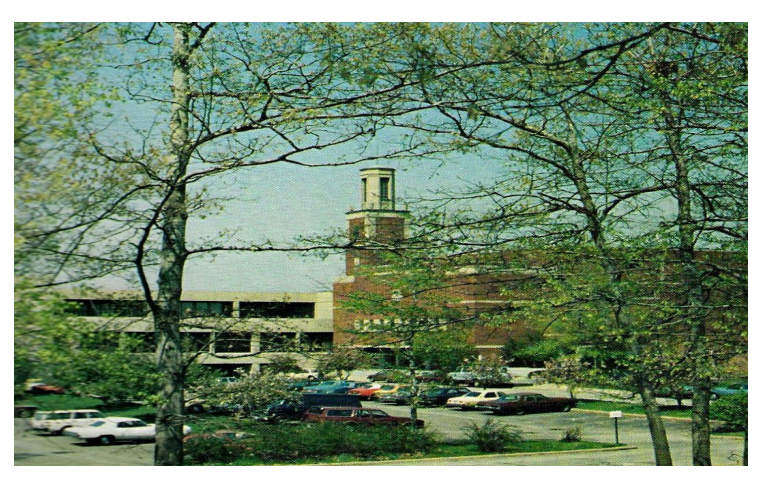
TODAY There is large concrete addition that was added on in 1973, Below is an arial view from 1954

When PSHS opened in 1953 it was the largest high school under one roof in the state. Located on 46 acres of land, it was in the geographical center of the 3 communities it served. PSH was designed by Architect Fulton, Krinsky, Dela Monte at a cost of $5.5 million. In 1951 construction began on 38 acres of the 48 acres purchased from the city of Parma for $10,000.00. The original building covers 20 acres and it was built in the Georgian Architecture that is two stories with a clock tower at one end. The building is red brick with limestone trim. PSH opened in October to an enrollment or over 1000 students in 4 grades. The first graduating class had 317 students. By 1962 it had an enrollment of 3500 students in 3 grades and the graduating class had over a thousand. Do you remember trying to get to class in 5 minutes through these halls in 1961? (See photo below) The bottom right photo shows the Auditorium Fover when it first opened, All the hallway floors were terrazzo marble. Today there are about 1500 student in grades 8 through 12 and a graduating class less than 300. Additions from 1973 to the '80's added 1/3rd to the size of the building. THE QUEEN IS STILL THE QUEEN, JUST A LITTLE OLDER -HAPPY BIRTHDAY!