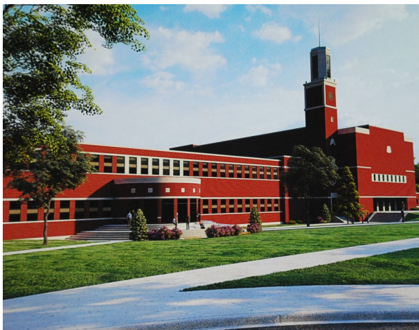
ARTIST RENDERING NEW FRONT OF THE PARMA SR.CIVIC CENTER

Cont pg 1 Letters to the Editor: - when the two new buildings are finished.