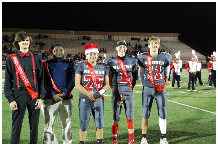
KING AND HIS COURT

THE ALUMNI MARCHING BAND 13 Alumni band members showed up to march with this years Varsity band, before and at half time. Thank you.