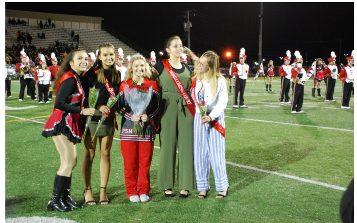
THE QUEEN AND HER COURT