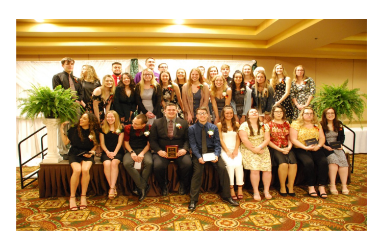
The Annual PTA Scholarship Dinner All PSHS winners 30 + in all. Alumni Assoc. 11