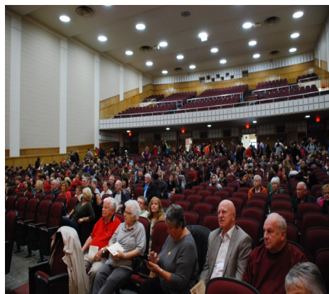
Photo of the updated Auditorium during the morning assembly for the Hall of Fame inductions.

This issue marks our 24th volume of the Tradition. Over the years we have tried to make each issue informative and entertaining. We try to let you know what is currently happening at PSH while remembering the past. So this year we will try to include more photos, and articles from our readers. We have so many interesting grads with stories to tell about lives at PSH and after. Our goal is to provide the human fabric of PSH, who we are and what we have done.