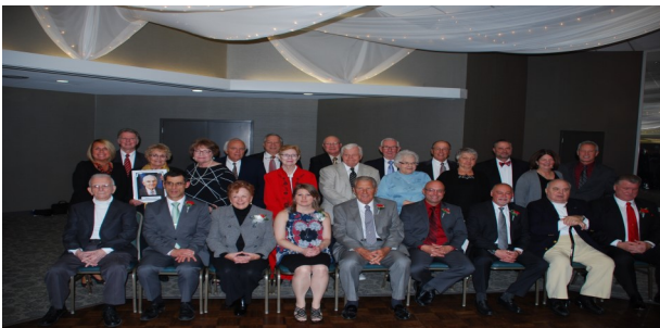
This is a photo of all the Hall of Fame members who were able to attend this years Hall of Fame-dinner. The total number of Hall of Fame Members is 74 Here are their names below and on page 7.