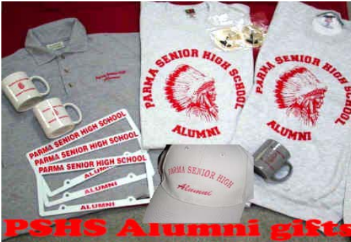
PSHS Alumni gifts

Order by sending a check or money order to PSH Alumni Assoc. 6285 W. 54th St., Parma, OH 44129. State size of shirt. Allow 4 weeks for delivery.