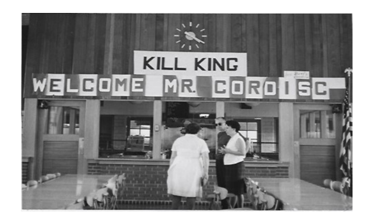
1967 - Signs to welcome the new principal and cheer on the football team in the upcoming game against Lorain Admiral King High School.