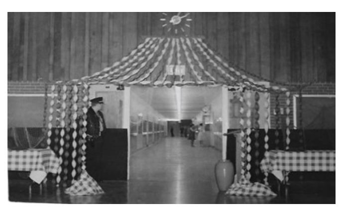
1968 Decorating for the Junior Dance "The Royal Americans",