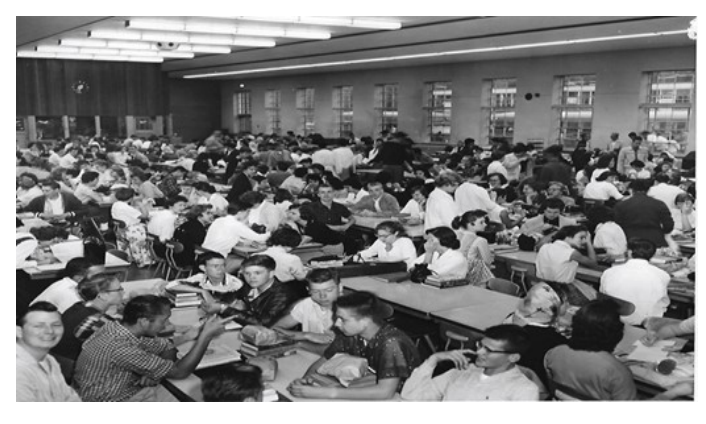
1959 - Early morning crowd just off the school buses waiting to be released to lockers and homerooms.