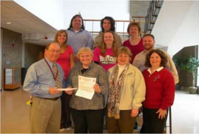
Teacher Grant the Shiloh Middle School Teachers for $300