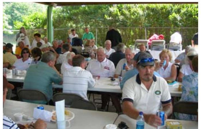
Alumni Scholarship Golf outing at Ridgewood Golf Course June 24.