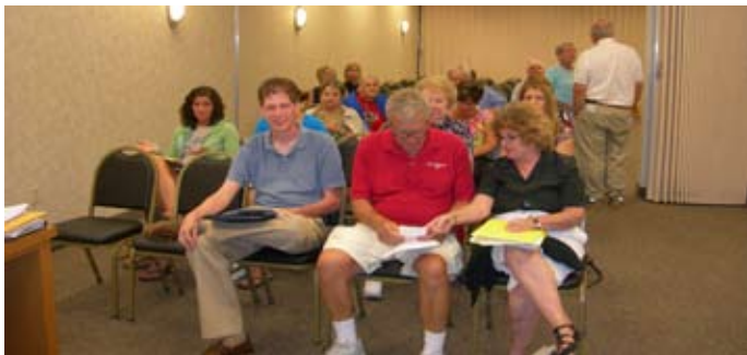
2009 Alumni Assoc Annual meeting-August 4