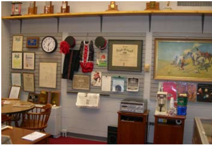
Alumni Archival Room at PSH.