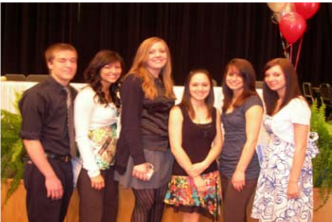
PSH Alumni scholarship winners.