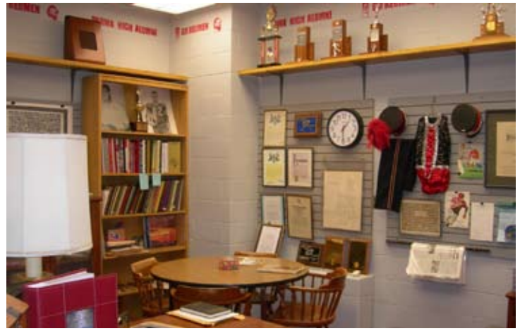
Alumni Archival Room at PSH.