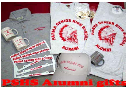
PSHS Alumni gifts

Order by sending a check or money order to PSH Alumni Assoc. 6285 W. 54th St., Parma, OH 44129. State size of shirt. Allow 4 weeks for delivery.